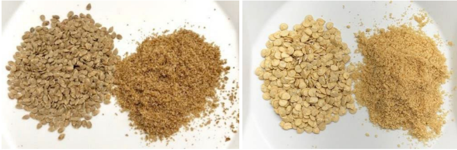
Figure 1. Demonstration of ground tomato (left) and pepper (right) seed flours comparing to unground seeds

4.1.2. If desired, prepare the internal control (IC) and add to subsamples prior to sampling for RNA extraction (see appendices).