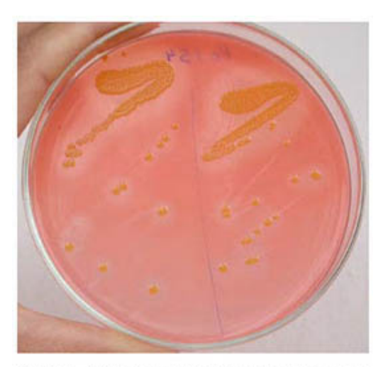
Figure 1. Cultural characteristics of Curtobacterium flaccumfaciens pv. flaccumfaciens isolated from bean seeds on the CFFSM culture medium.

Colony morphology on CFFSM. Maringoni et al., 2005