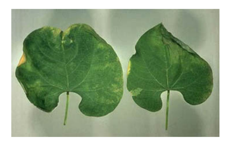
Primary bean leaves infected by CFF.